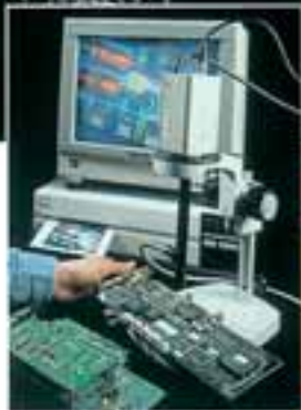
Lenses and cameras